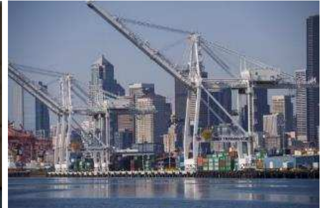
Oversize Cargo Service