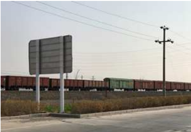
Rail Freight Service