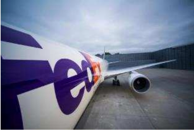
Air Freight Forwarding