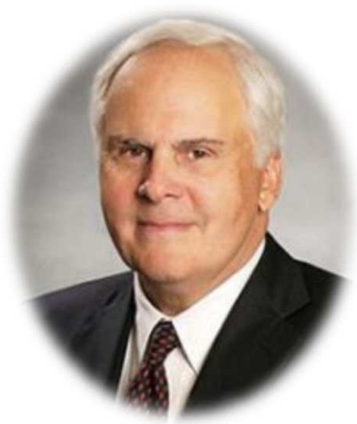
Frederick W. Smith Chairman and CEO